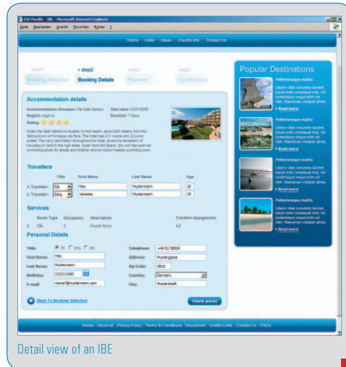
Detail view of an IBE

With its numerous interfaces, Pacific will be the center part of your future system environment.